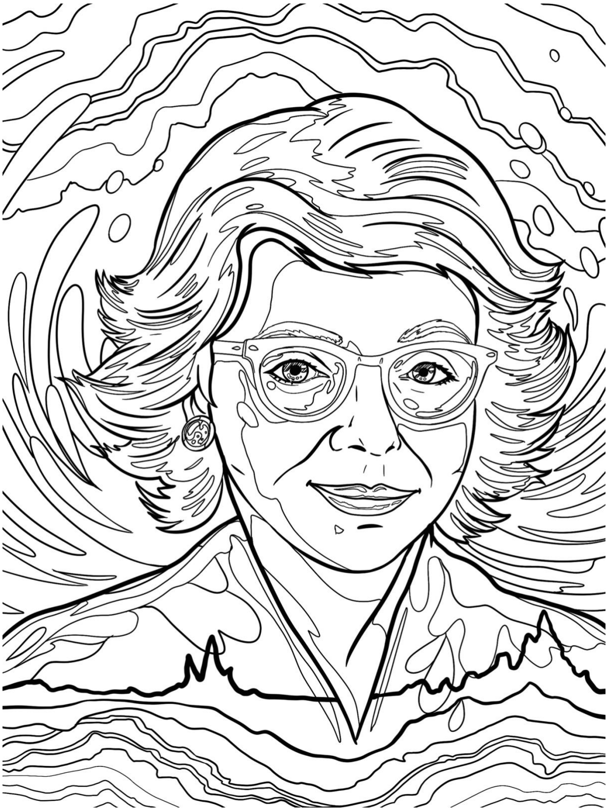
Marie Tharp, created the first scientific maps of the ocean floors (1920-2006)