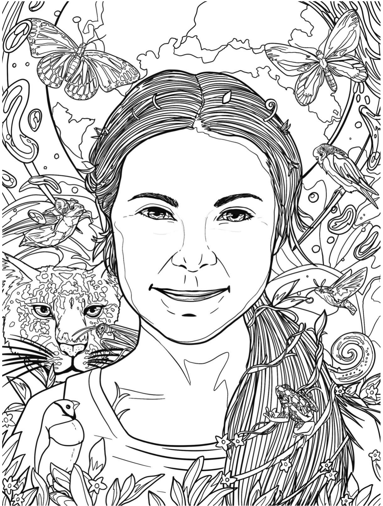
Greta Thunberg, climate activist