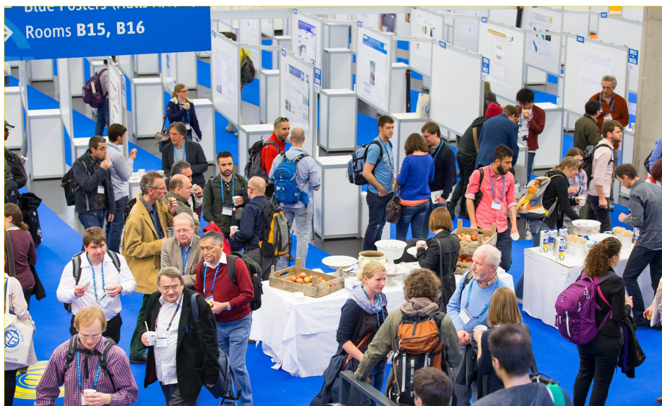
Poster Hall at the EGU 2015 General Assembly at the Austria Center Vienna

Please note that an Abstract Processing Charge (APC) of €40 must be paid for each abstract submission. For late abstracts (submitted by conveners after 11 January 2017) a higher APC of €80 gross will be invoiced. The deadline for late abstract submission is 20 January 2017. Abstracts are only processed and available for the session organisation by conveners after the payment is complete. Please note that this is a processing charge and not a publishing fee. Therefore, APCs are non-refundable in case of abstract withdrawal, rejection or double submission, and the charges collected cover the cost of processing the abstracts, whether or not one attends the meeting. Further, the APC does not register you for the General Assembly so you must register separately to attend the meeting and pay the appropriate registration fee. Solicited speakers do not receive discounted APCs, registration fees or travel reimbursement. Additional information about why the EGU introduced APCs is available online .