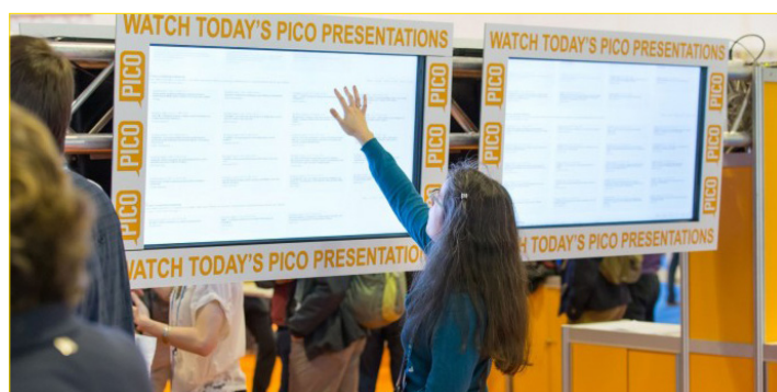
Reviewing the day's PICO presentations.

each presenting author. They can feature traditional PowerPoint slides, a movie, an animation, or simply a PDF showing your research on a large screen. After the 2-minute talks, the audience can explore each presentation on touch screens, where authors are available to answer questions and discuss their research in more detail. Furthermore, the presentations remain available after the end of a PICO session and can be viewed on the touch screens throughout the day of the session. This gives the opportunity to later