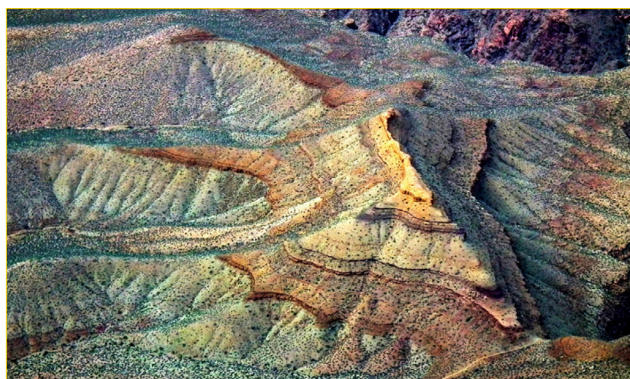
One of the EGU 2014 Photo Competition winning photos: 'Erosion spider' .

Since 2010 there has been a photo competition open to all those pre-registered to the General Assembly. A call for entries goes out in February, with images being submitted to Imaggeo throughout the month. Photos can be on any broad theme related to the Earth and space sciences. Each pre-registered participant can submit up to three photos and one moving image. If you submit your images to the EGU Photo Contest, you also are submitting the photos to the EGU's image repository, Imaggeo. Being open access (see the copyright information online ), it can be used by scientists for their presentations or publications, and more, provided the photographer is credited. You retain full rights of use as your uploaded image is licensed and distributed by EGU under a Creative Commons licence . Shortlisted photos are exhibited at the EGU General Assembly, where participants vote for their favourites. The winners are announced on the Friday of the General Assembly. Further information and previous winners can be viewed online at Imaggeo. The winning images are turned into postcards that are distributed at the next General Assembly.