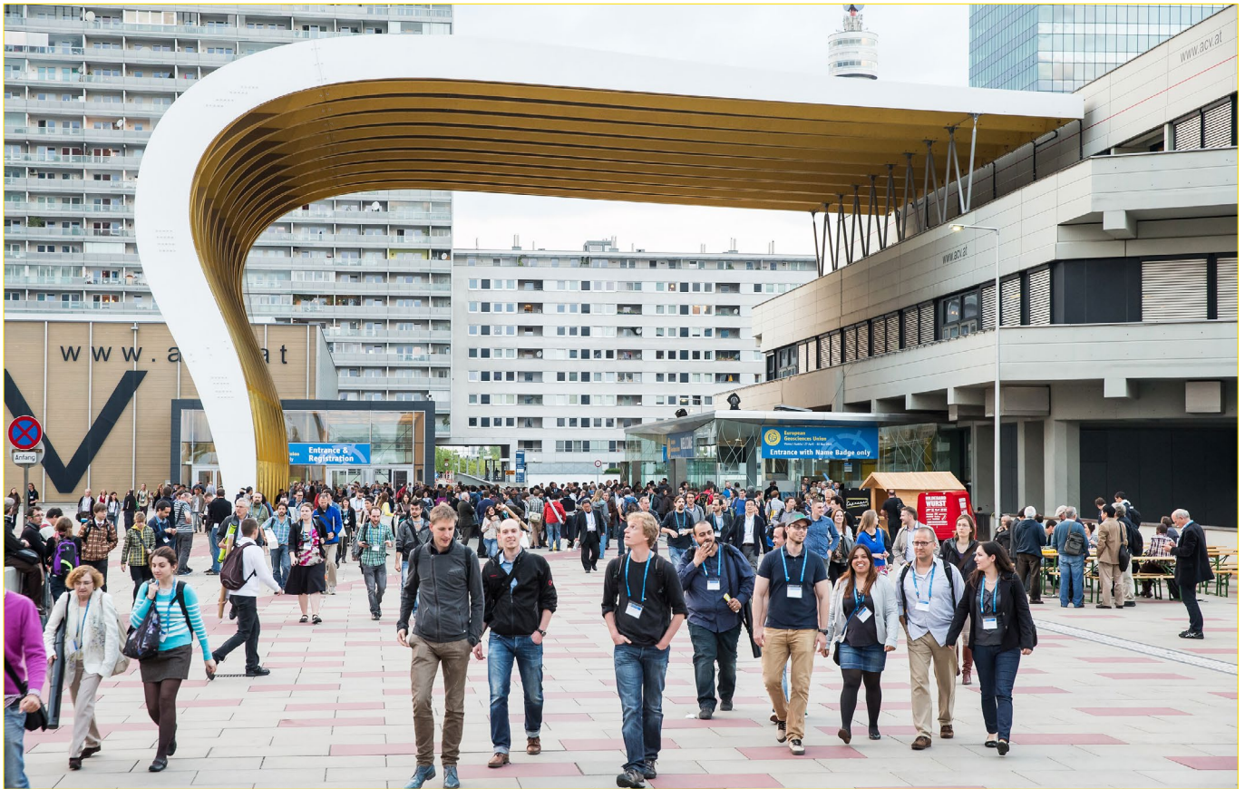
Entrance to the Austria Center Vienna during the EGU 2014 General Assembly