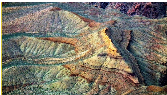
One of the EGU 2014 Photo Competition winning photos: 'Erosion spider' .

Since 2010 there has been a photo competition open to all those pre-registered to the General Assembly. A call for entries goes out in February, with images being submitted to Imaggeo throughout the month. Photos can be on any broad theme related to the Earth and space sciences. Each pre-registered participant can submit up to three photos and one moving image. If you submit your images to the yearly EGU Photo Contest, you also are submitting the photos to the EGU's open access image repository, Imaggeo. Being open access (see the copyright information online ), it can