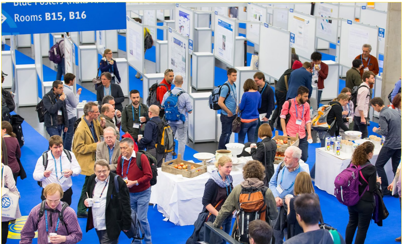
Poster Hall at the EGU 2015 General Assembly at the Austria Center Vienna