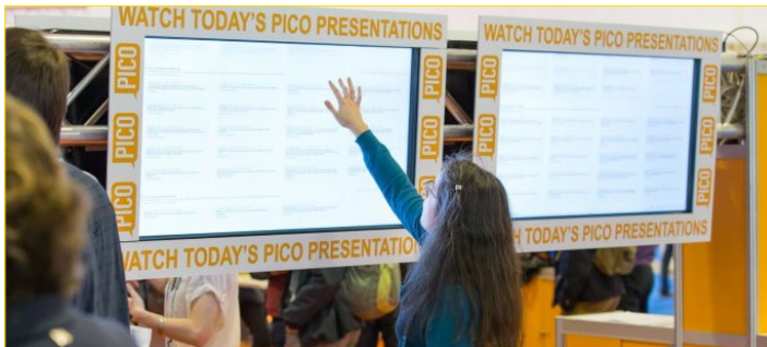
Reviewing the day's PICO presentations.

at designated PICO spots, which combine touch screen displays with a presentation screen. PICO sessions start with “2 minutes of madness” in which all authors present the essence of their work with 2 slides in 2 minutes. Afterwards, the audience uses the touch screens to view again their PICO presentation(s) of interest. Find out more about PICO on the General Assembly web-site .