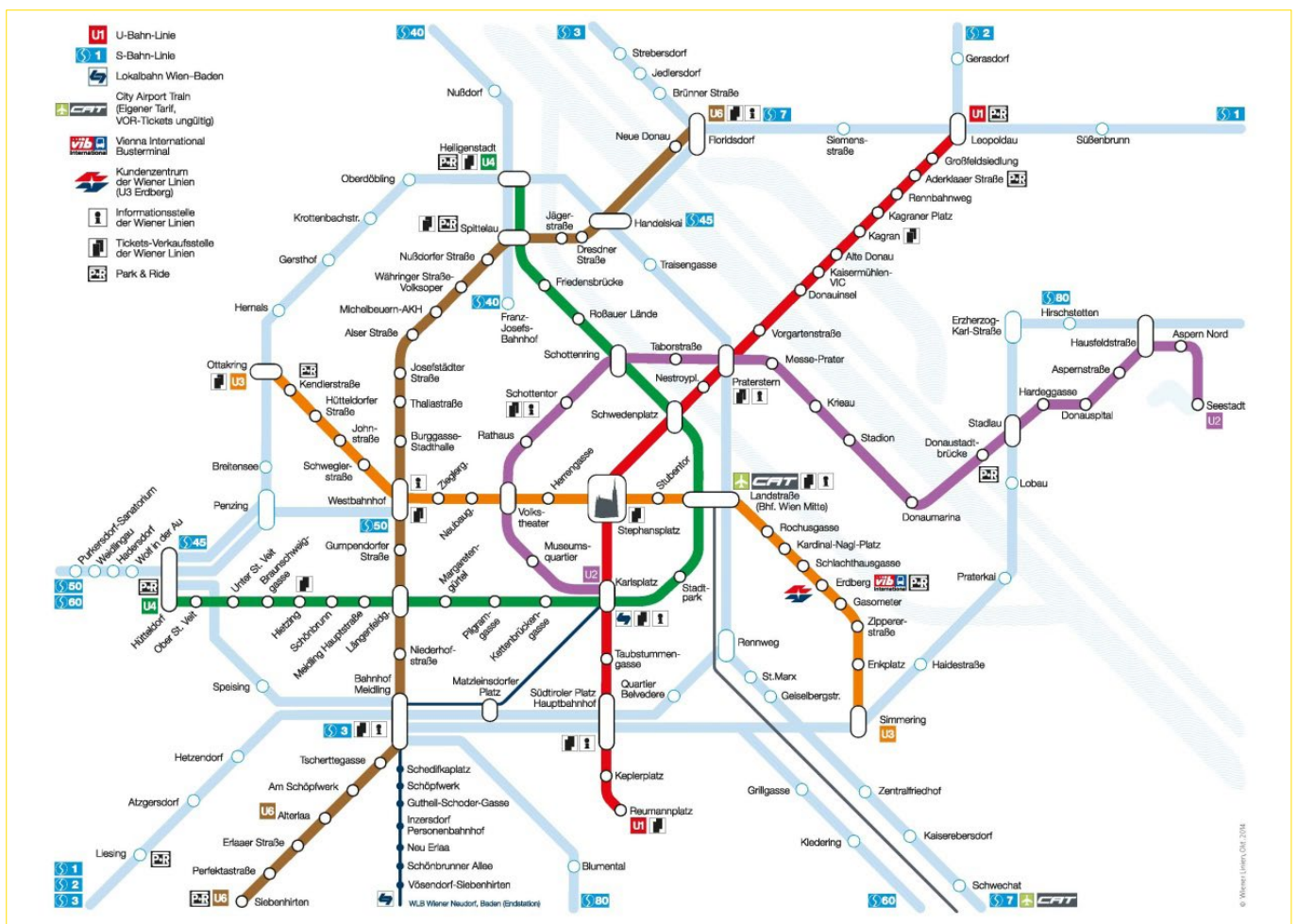
Vienna U- and S-bahn map ( see original ).

For European residents, the most economical alternative is usually an InterRail ticket. On an InterRail Global Pass (€264, or €192 for people under 26 travelling second class), you can travel on trains unlimited for 5 days within a 10-day period. For more information on InterRail see www.interailnet.com .