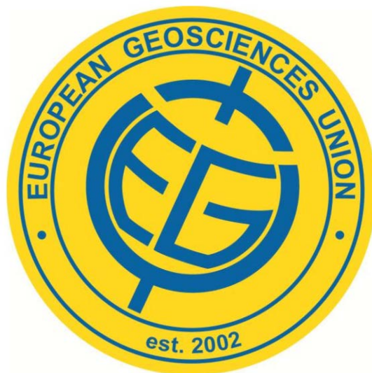
The European Geosciences Union Logo.

The European Geosciences Union ( www.egu.eu ) is Europe's premier geosciences union, dedicated to the pursuit of excellence in the Earth, planetary and space sciences for the benefit of humanity, worldwide. It is a non-profit interdisciplinary learned association of scientists founded in 2002. The EGU has a current portfolio of 16 diverse scientific journals , which use an innovative open access format, and organises a number of meetings, including the annual EGU General Assembly, and education and outreach activities. These activities include Geosciences Information For Teachers (GIFT) workshops, the support of young scientists , media services (including press releases , the EGU blogs , and newsletter ), together with an awards and medals programme for outstanding scientists.