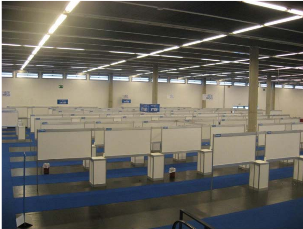
Poster Hall at the EGU General Assembly at the Austria Center Vienna (ACV).