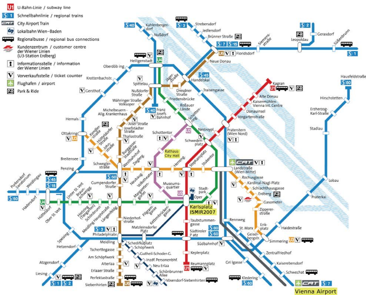
Vienna U- and S-bahn map.

The Austria Center Vienna (ACV) is the event venue and is located next to the “Kaisermühlen/Vienna Int. Centre station on the subway line U1, which runs from the city centre (Stephansplatz) to Leopoldau. A Vienna metro plan can be found below and a travel planner for Vienna can be accessed on the city’s main transport website (Wiener Linien).