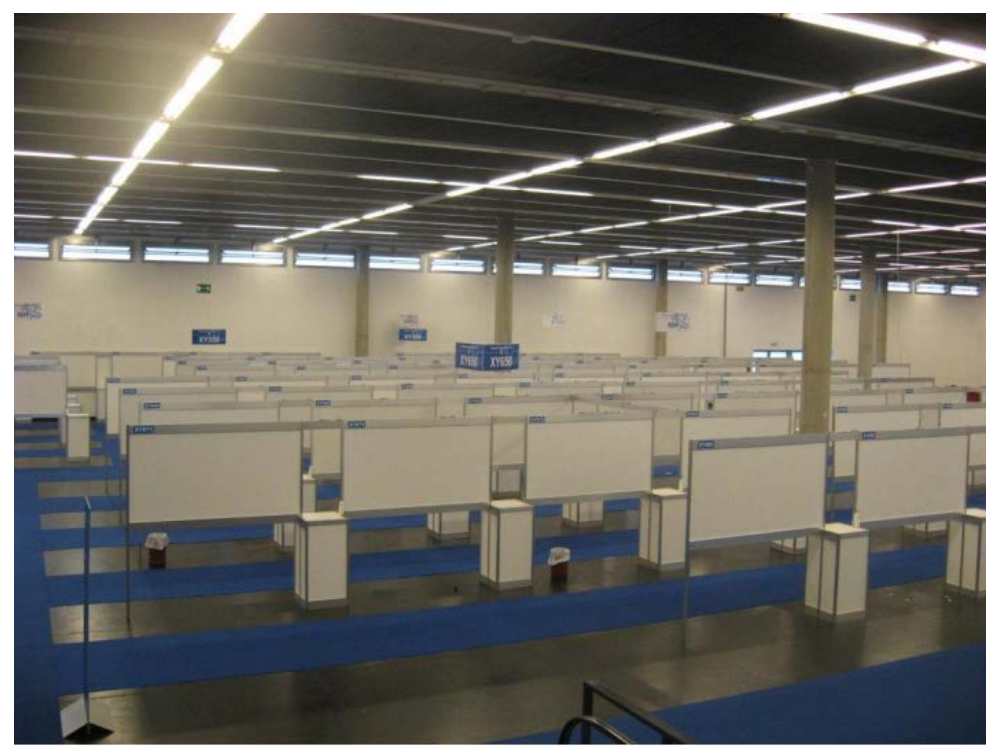
Poster Hall at the EGU General Assembly at the Austria Center Vienna (ACV).