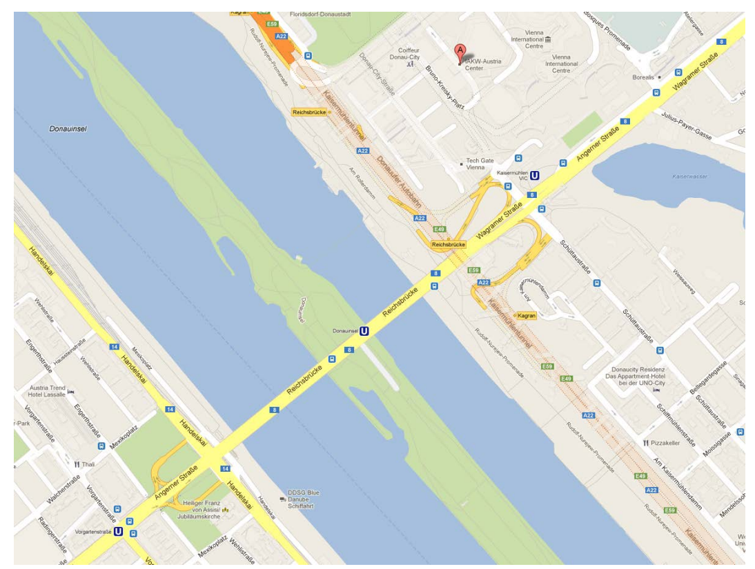
Austria Center Vienna location (top) [source].

The Austria Center Vienna is also reachable via the Airport Bus (link) running to the station "Wien Kaisermühlen/VIC" close to the ACV.