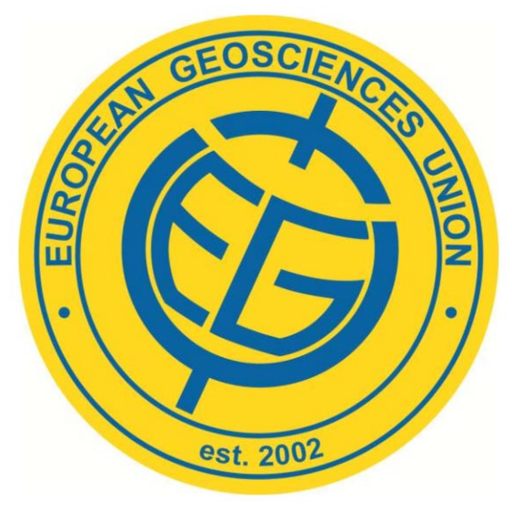
The European Geosciences Union Logo.

The European Geosciences Union (<a href="www.egu.eu">www.egu.eu</a>) is Europe's premier geosciences union, dedicated to the pursuit of excellence in the Earth, planetary and space sciences for the benefit of humanity, worldwide. It is a non-profit interdisciplinary learned association of scientists founded in 2002. The EGU has a current portfolio of 16 diverse scientific journals, which use an innovative open access format, and organises a number of meetings, including the annual EGU General Assembly, and <a href="education">education</a> and <a href="outreach">outreach</a> activities. These activities include <a href="Geosciences">Geosciences</a> Information For Teachers (GIFT) workshops, the support of <a href="young scientists">young scientists</a>, media services (including <a href="press">press</a> releases, the <a href="EGU blog">EGU blog</a>, <a href="blog">blog</a> network</a> and <a href="memory.newsletter">newsletter</a>), together with an <a href="memory.newsletter">awards and medals</a> programme for outstanding scientists.