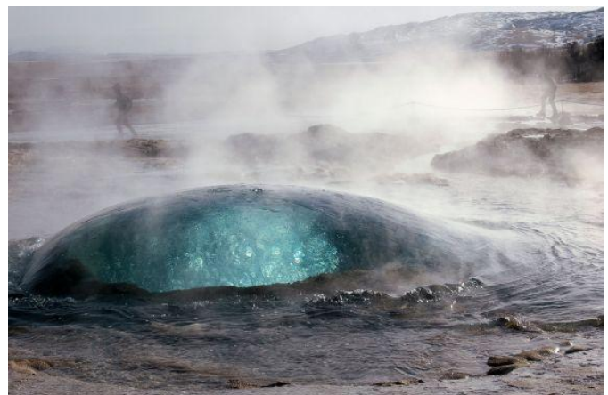
“Geysir, image by James Levine, distributed by EGU under a Creative Commons licence. Awarded 1st Place in the EGU GA 2011 Photo Competition.