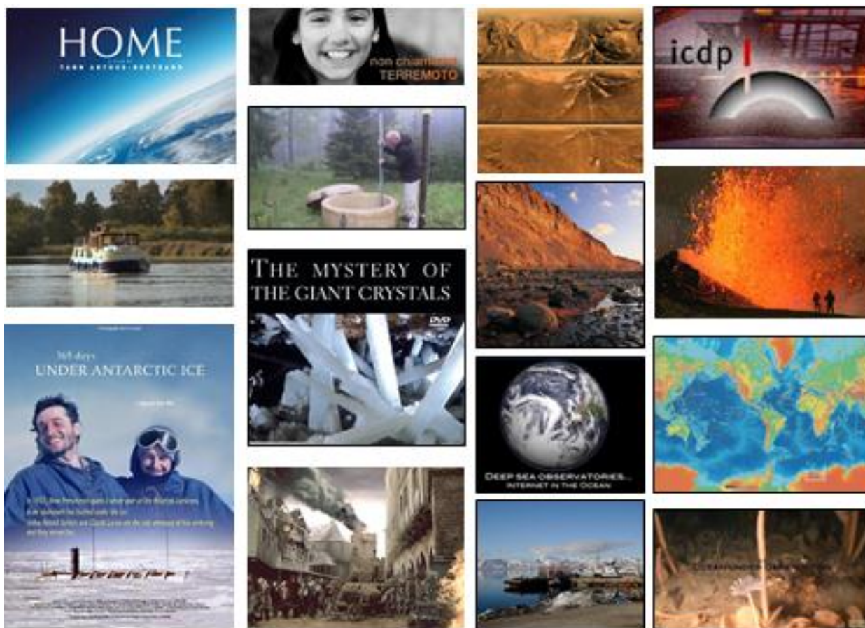
Selection of films shown at previous Geocinemas

The Geocinema presents a selection of geoscience related films. All films have an English soundtrack or English subtitles. Films have duration between several minutes to 90 minutes.