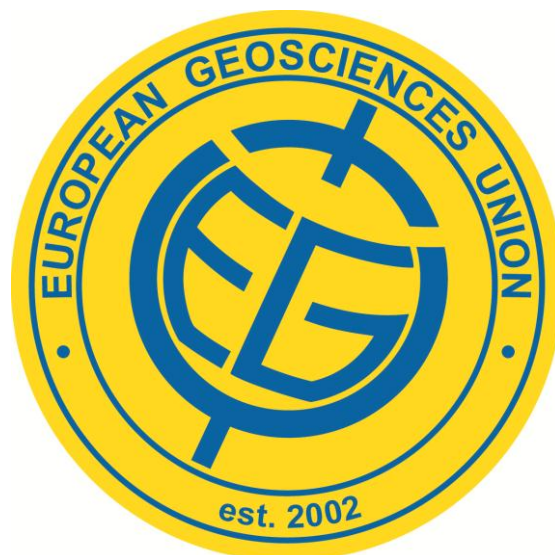
The European Geosciences Union Logo