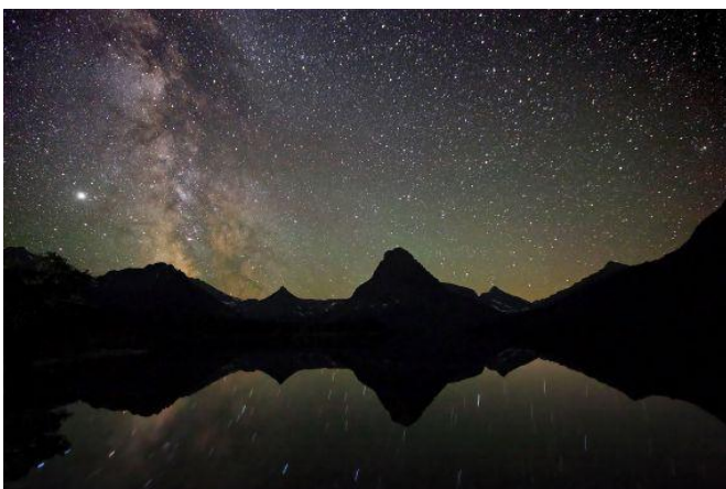
“Patterns in the Void, image by Christian Klepp, distributed by EGU under a Creative Commons licence. Awarded 1st Place in the EGU GA 2010 Photo Competition.

Since 2010 there has been a photo competition at the General Assembly, open to all those registered. A call for entries goes out in advance of the meeting, with images being submitted to IMAGGEO ( http://www.imagegeo.net ) two months before the General Assembly. Photos can be on any broad theme related to the Earth and Space Sciences. Each pre-registered participant can submit TWO images. If you submit your images to the yearly EGU photo competition, you also are submitting the photos to the EGU Photo Database, IMAGGEO. Being open access (see the copyright/terms and conditions online), it can be used by scientists for their presentations or publications as well as by the press. However, you retain full rights of use, since your uploaded image is licensed and distributed by EGU under a Creative Commons licence. If a winning entry, you also agree for the photo to be exhibited at the EGU General Assembly. Between 9-10 entries are short-listed with participants at the General Assembly voting for their favourites. The winners are announced on the Friday of the General Assembly. Further information and previous winners can be viewed online at IMAGGEO ( http://www.imagegeo.net/page/egu-photocontest-general-information ). The top three images are turned into postcards that are distributed at the next General Assembly.